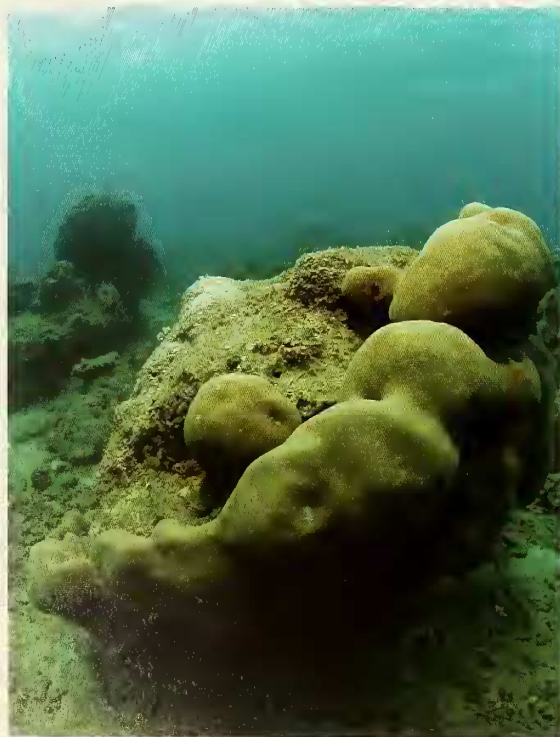
Figure 8. Overturned live Porites sp. colony at 4 m water depth on the north coast of Aceh Province, October 27, 2005.